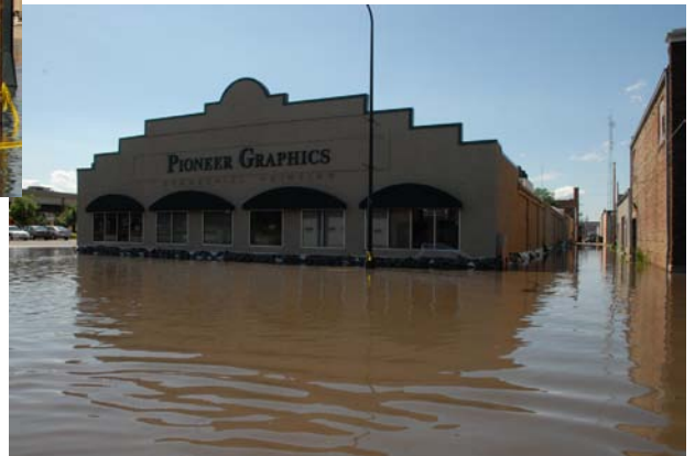
Pioneer Graphics, the company who prints UIU’s alumni magazine The Bridge , is only two blocks from the Cedar River in downtown Waterloo. Their building was surrounded by water, but luckily the sandbags kept the damage minimal.

Tisl said the greatest threat to the center building was