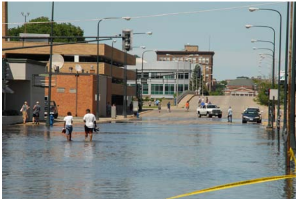
This is one of several bridges in Waterloo that cross the Cedar River. While the bridge is dry, the streets surrounding it were low enough to be engulfed by the rising water. Eventually, nearly every bridge in the city closed due to the high water.

Luckily, Davidson knew of no UIU employees who were wiped out by the floods. Some students had been displaced,