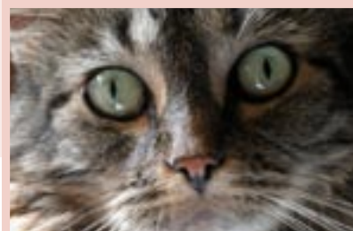
Joel Kunze's First Place Photograph in Division 10—Photography, Class 51009 (Color Animals)