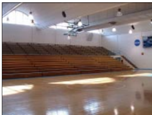
Top photo: Dorman Gymnasium before renovation began. Bottom photo: the bleachers with the bottom section removed.

After two years of planning, a crew of workers, including a local contractor and six UIU stu-