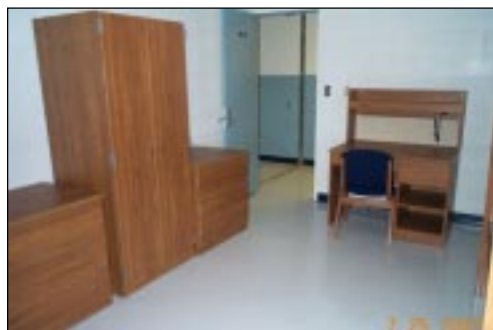
New floor, paint, and furniture on 2nd floor Garbee.

We strive to meet the needs of a growing University community by continuously maintaining and improving a safe, comfortable, and attractive environment.