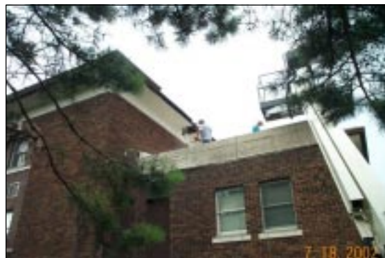
Work on Edgar roof begins.

antly surprised to find that the restrooms on the main floor have been upgraded with new acoustical ceiling tile and freshly painted walls.